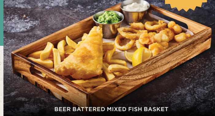
BEER BATTERED MIXED FISH BASKET

Freshly beer battered fish, king prawns and calamari, served with chips, mushy peas and tartare sauce Add Bread & Butter 1.99 Double up your chips or swap to sweet potato fries 1.00