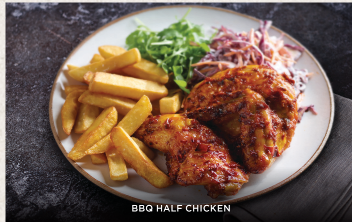
BBQ HALF CHICKEN

Homemade with our secret house spices and served with rice and poppadom