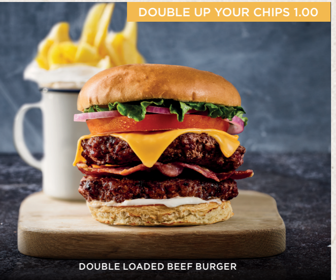
DOUBLE LOADED BEEF BURGER